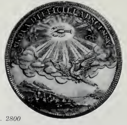
Lot No. 2800

QUEDLINBURG. Anna Dorothea, 1685-1704. Taler, 1704. Obv. A formidable draped bust of the Abbess. Rv. A profile of the Convent and mountainous scenery, clouds above with radiant zodiacal signs. Dav.2604. Sharply struck. Uncirculated and very rare. (1,500-1,750)